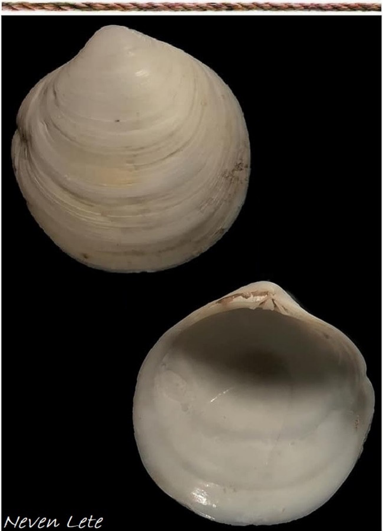
Mysia undata (Pennant, 1777) - Petricolidae